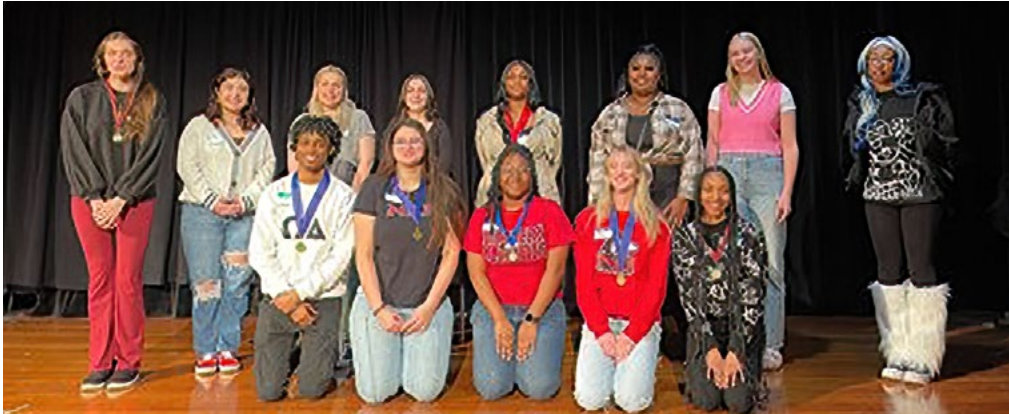
First-year student awardees at the 14th Annual Showcase for Student Writing.

Our English faculty, staff, students, and alumni are consistently enhancing their academic and larger communities. Below are a few of the many exciting contributions and achievements from 2022-2023.