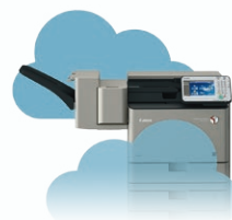
imageRUNNER ADVANCE C350P model shown.

Through its Life Cycle Assessment (LCA) System, Canon has lowered CO 2 emissions by focusing on each stage of the product life cycle, including manufacturing, energy use, and logistics. These products are designed with less packaging to be small and light with high performance. They're intended to help make transportation more efficient.