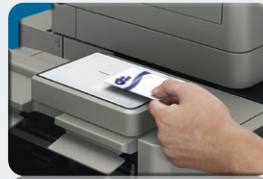
Contactless Card Reader