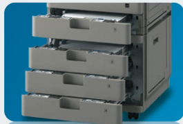
Easy Paper Access