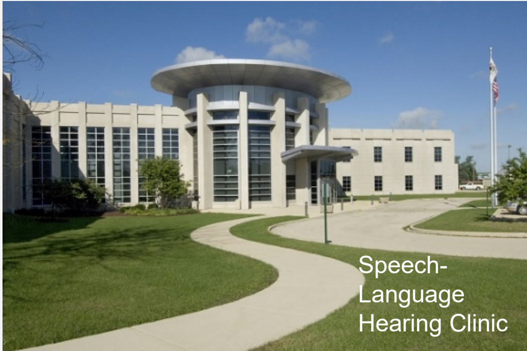
Speech- Language Hearing Clinic