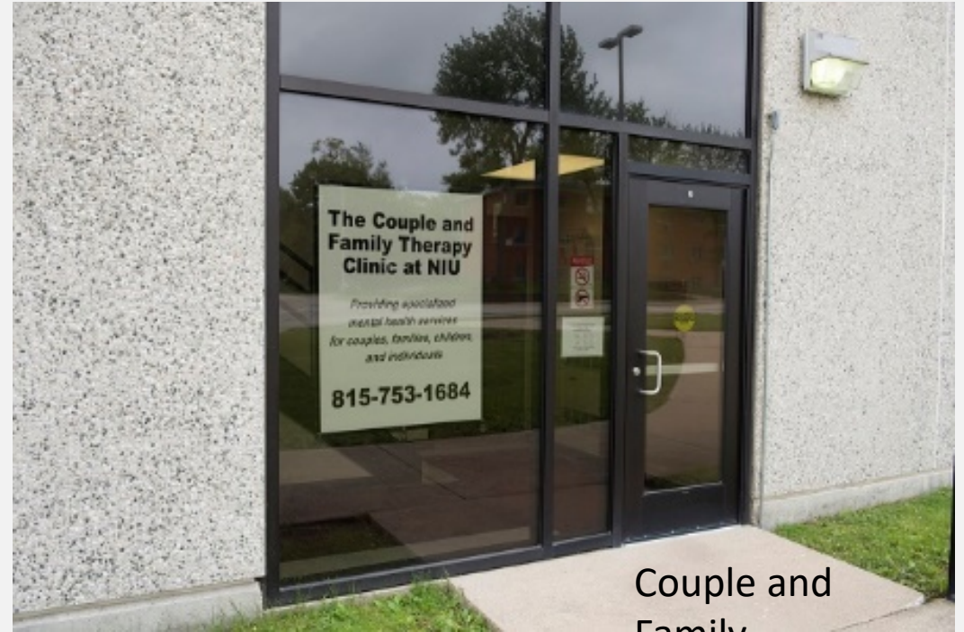
Couple and Family Therapy Clinic