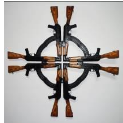
Mel Chin. Cross for the Unforgiven: 10 th Anniversary Multiple, 1 of 2 , 2012. AK47 assault rifles cut and welded, (54 x 54 x 3 in.).