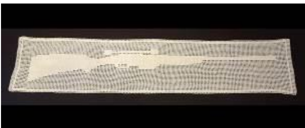
Stephanie Syjuco. Rifle , 1995. Cotton lace crochet panel, (12 x 53.5 in.) Collection of Marcia Tanner.