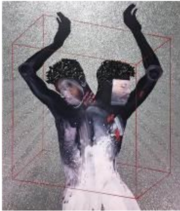
Devan Shimoyama. You will have to sing. Paper won't hold the wound I leave. 2015. Oil, glitter, and colored pencil on canvas, (64 x 54 in.). Courtesy of the artist.