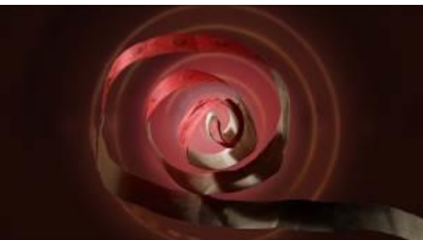
Andrew Ellis Johnson. Massacre of the Innocents , 2015. HD video, detail from film still. Courtesy the artist.

High-resolution images will be sent as a separate attachment upon request.