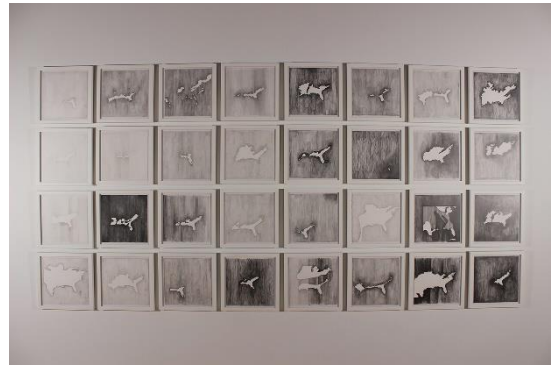
Anne J. Lindberg. Paper Forest , 2014. Graphite on paper. (individually framed 10 x 10 in.). Courtesy the artist.