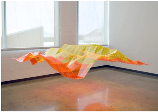
Stephen Cartwright. Mesh (Human Powered Outdoor Activity 2015), 2018. Acrylic, hardware (24 x 107 x75 in.). Courtesy the artist.