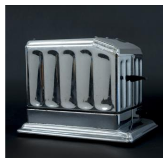
Top to Bottom: Leonetto Cappiello, Cognac Monnet, Poster, 1927, (79 x 51); courtesy Chicago Center for The Print. Two-Slice Toastmaster Model 1B3. Walters-Genter Corporation, Minneapolis, MN, c. 1932, Heavy chrome, (9 x 6 x 7); courtesy Elgin History Museum.