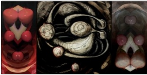
Jessica Gondek, Unidentified Object, Oil and Digital Print on Canvas, 72 x 36", 2005.

Solo show of abstract work by Montgomery artist Gondek who begins with compositions created via 3-D modeling programs that are then collaged and overprinted to reinterpret and humanize the computer-generated forms. The intermingling of hand and mechanical approaches in the work prompts a collision between intuition and computation.