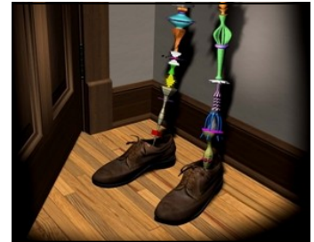
Gerald Guthrie, It Stands to Reason, Digital Print, 22.5 x 18.5", 1999.