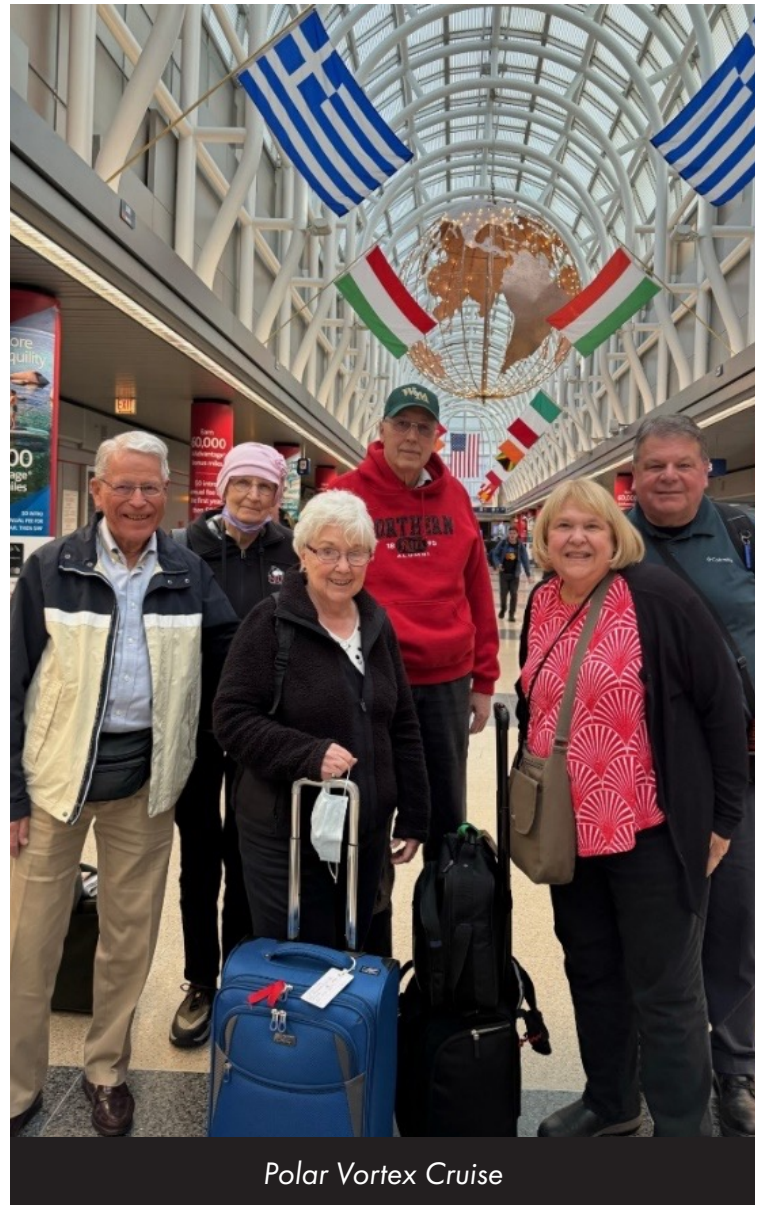
Polar Vortex Cruise