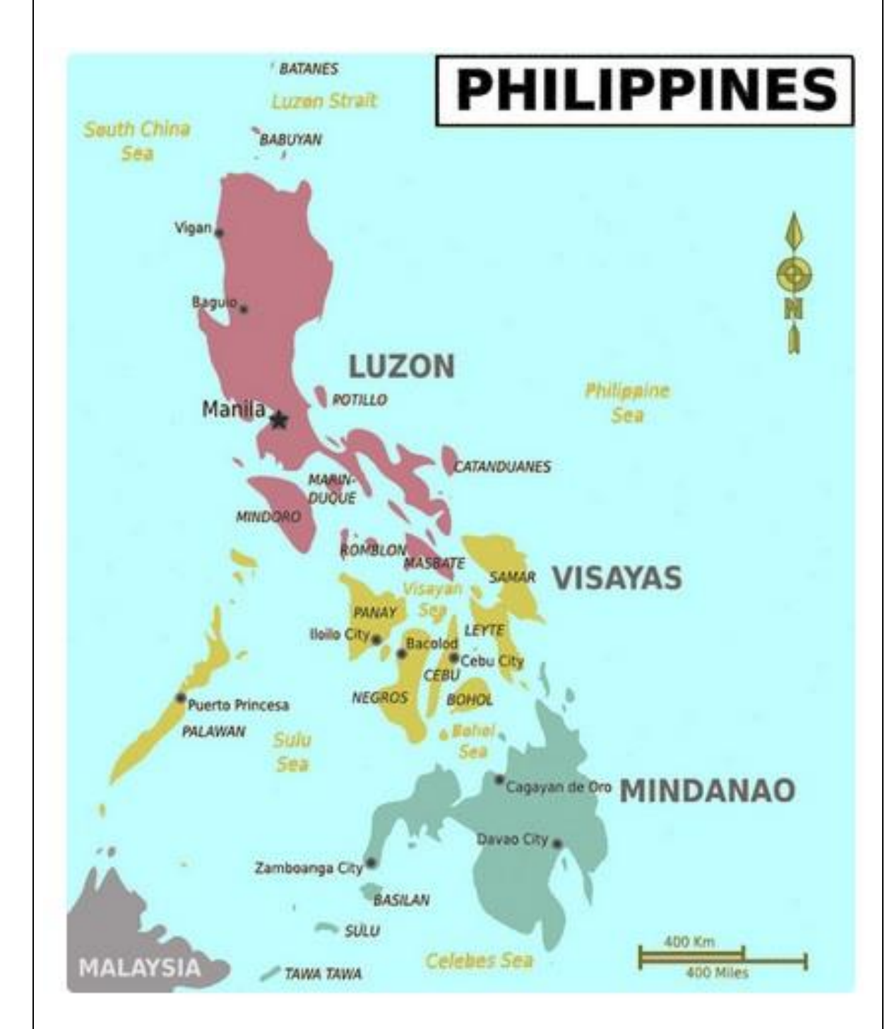
Appendix 6 – Map: Philippines