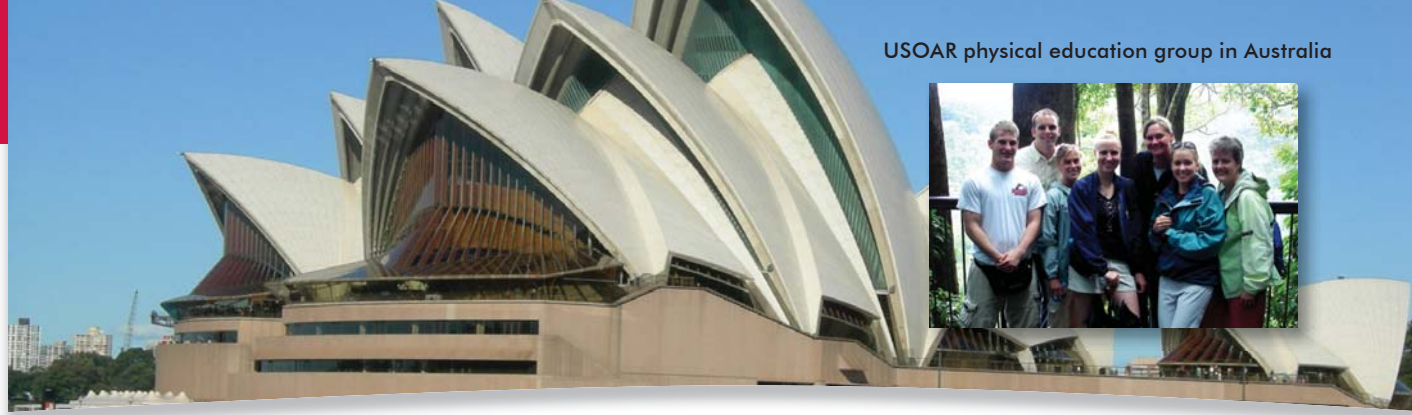
USOAR physical education group in Australia