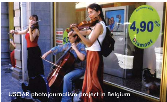
USOAR photojournalism project in Belgium

To view student proposals from previous years, visit the USOAR Web site: www.niu.edu/usoar/