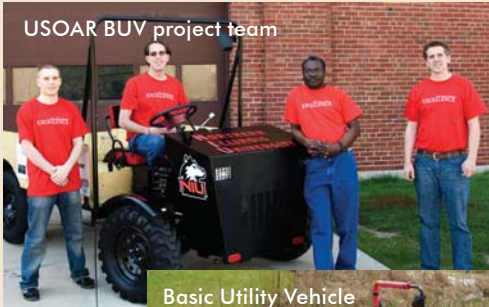
Basic Utility Vehicle (BUV) competition