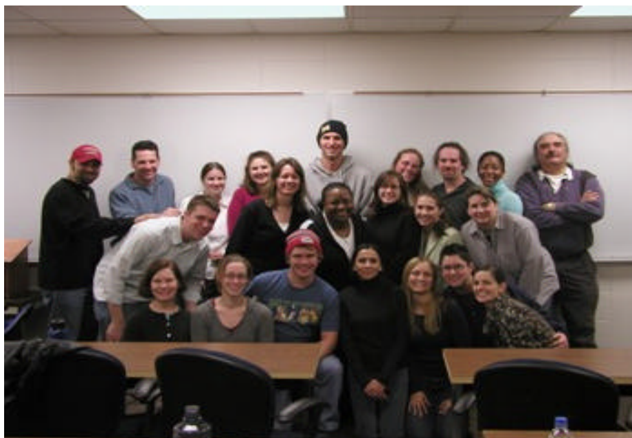
Pictured: Some of the current department