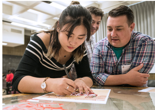
Personal and engaging