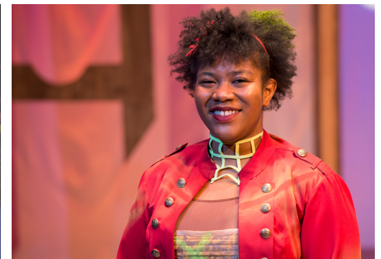
Inviting, warm personality