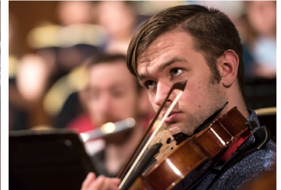
Energetic with good use of selective focus