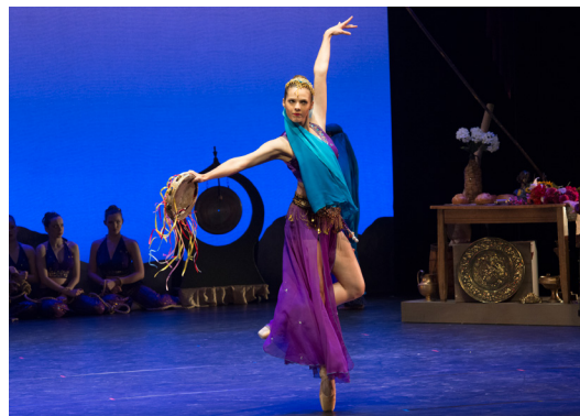
Rich, saturated color