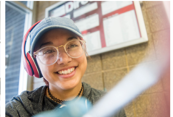
Genuine, authentic emotions