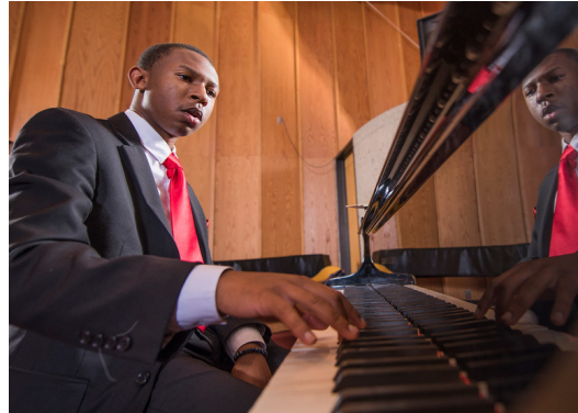
Interesting perspective with bright, natural lighting

Always select photos that reinforce NIU College of Visual and Performing Arts' brand personality. Imagery should convey student engagement that is authentic and creates an emotional connection with our audience. Look for photos that are warm and full of spirit and energy. Only select photos that have adequate image resolution.