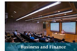
Business and Finance

► Link to policies that apply to the Arizona University System