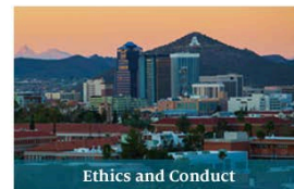
Ethics and Conduct

► Policies related to your working relationship with the University