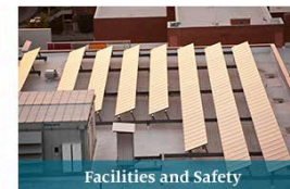
Facilities and Safety

► Policies related to personal and professional conduct