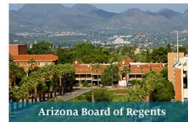
Arizona Board of Regents

► Policies related to operations and administration