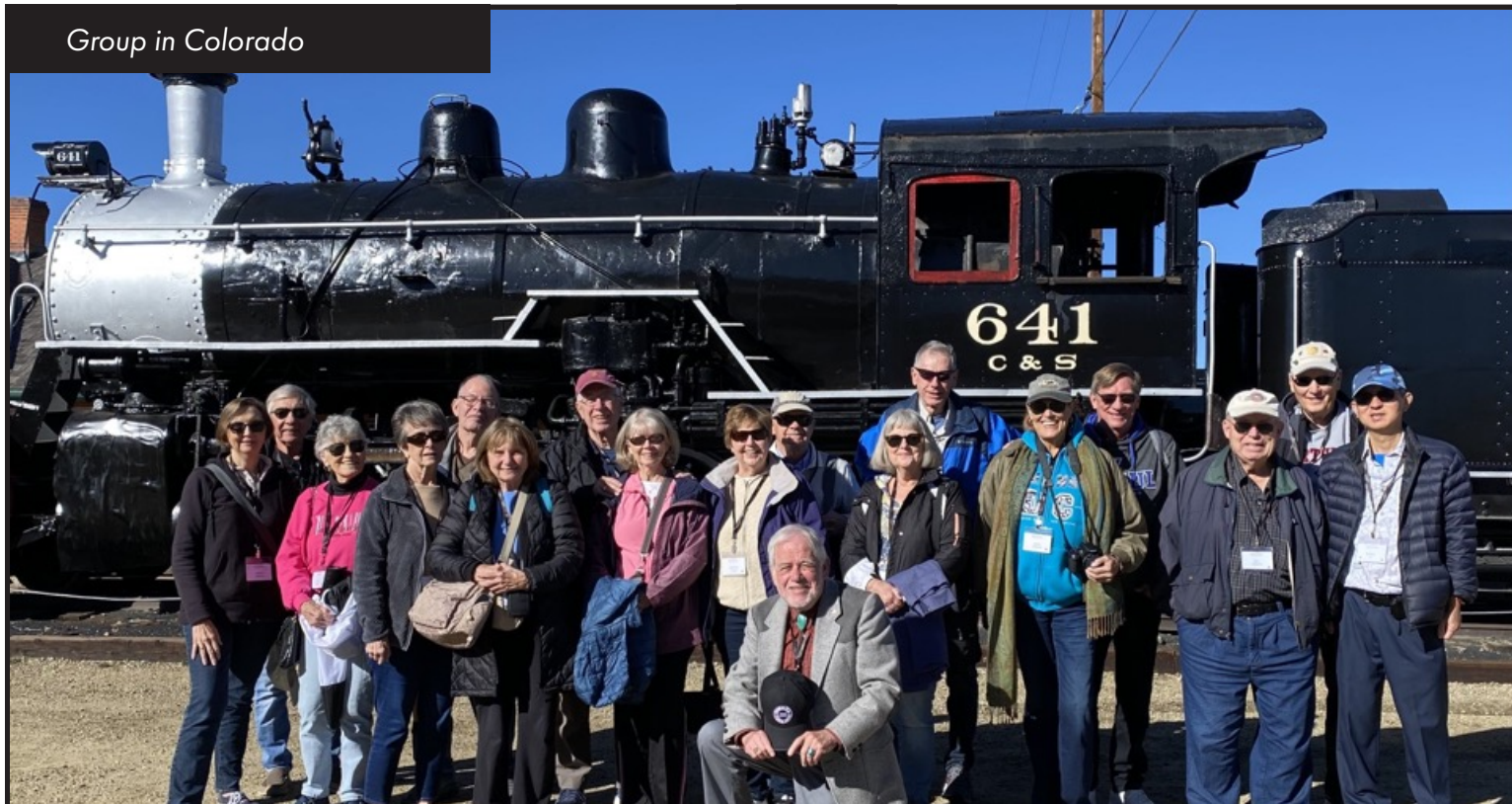
Group in Colorado