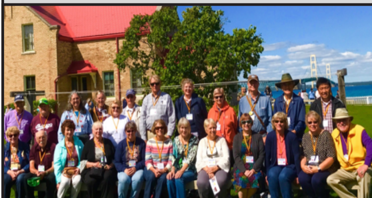
NIU Group in Mackinaw City